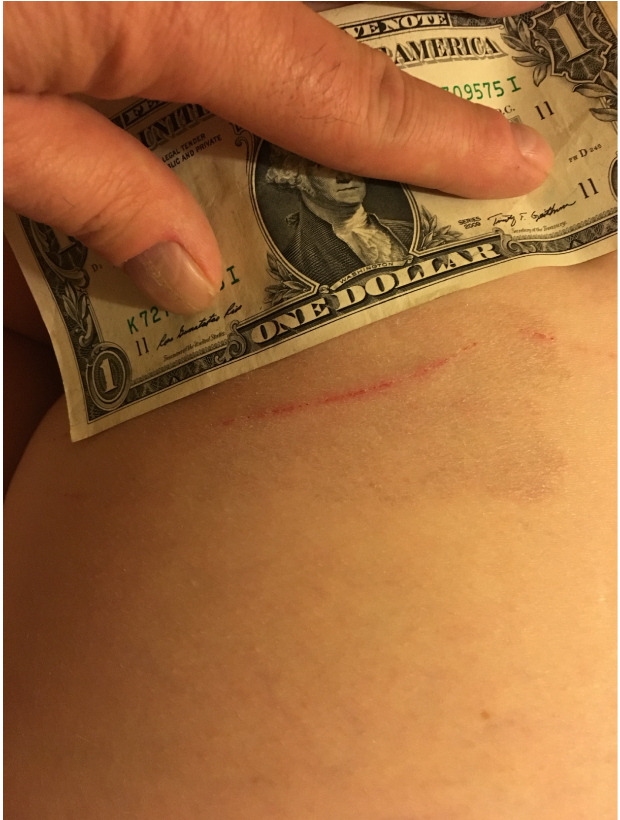
The left arc.