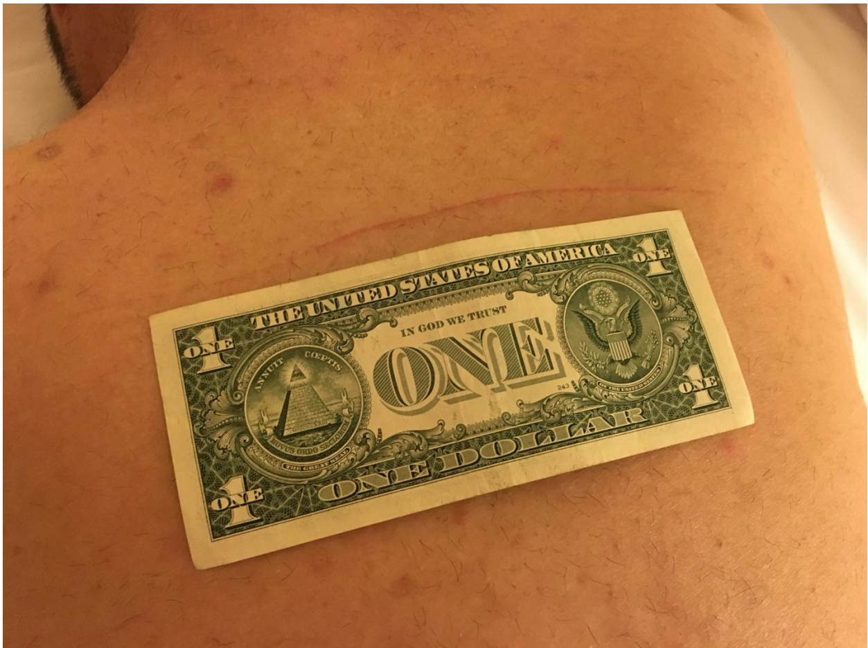
(That is my left neck and beard on the upper-left.)