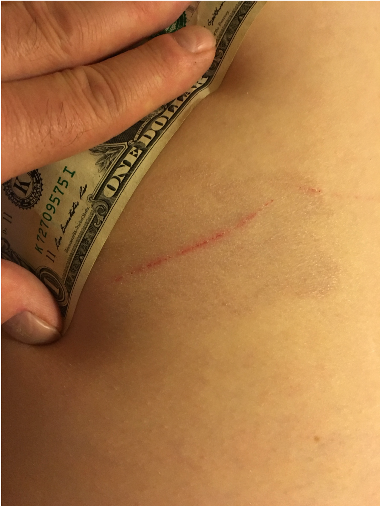
Another view of the left arc, trying for a better view but hiding Sally's left breast.