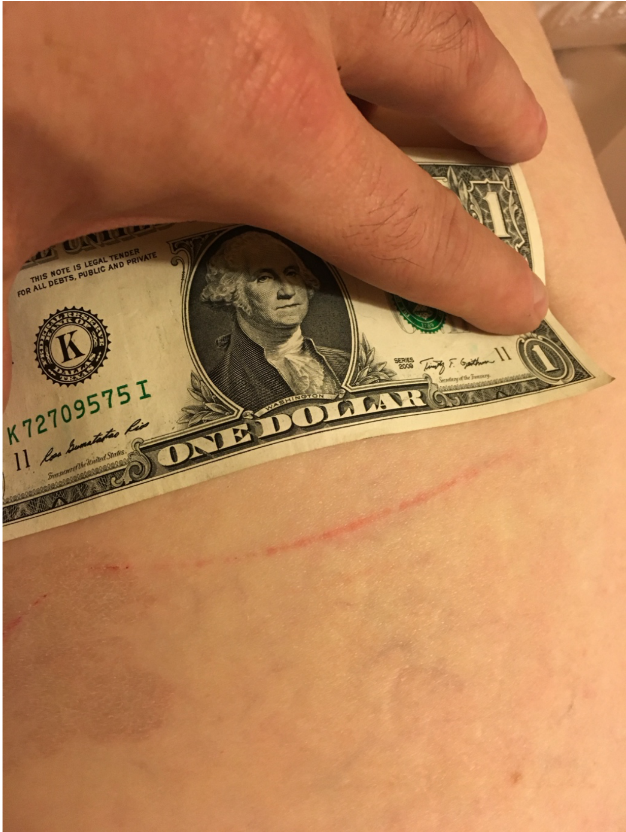
The right arc. On the right of this photo you can see what I believe is the edge of her back.